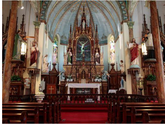
St. Mary's Catholic Church of High Hill