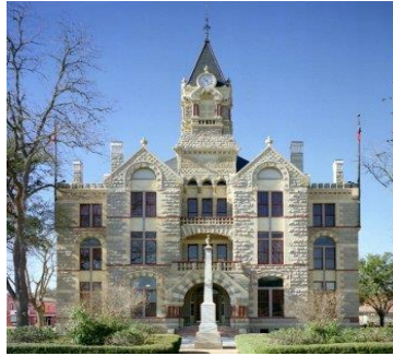
Fayette County Courthouse, La Grange, TX

Here's hoping this finds you all doing well in the New Year. It's hard to believe another year has come and gone and the 2017 convention is fast approaching. We would like to encourage you all to make every effort to attend this year's convention. The committee is working very hard to make this a very successful convention. The speakers will be very interesting and informative, the quiet country town of La Grange, one of the best in the area, and the food, fellowship and entertainment some of the finest around. Hope to see you all in La Grange, Texas on March 18 th .