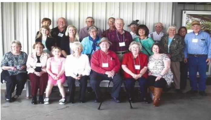
Bluebonnet Attendees at 2016 Convention Mentz, TX

We look forward to 2017 to programs that will preserve our German heritage, language and culture. Meetings scheduled at the Hill Center in Sealy are January 25, March 22, May 24, July 26, September 27 and November 15. Everyone is invited.