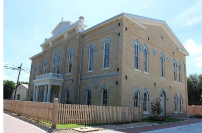
Casino Hall, La Grange, Texas