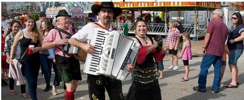
Old Town Tomball, Texas Historical Train Depot Plaza