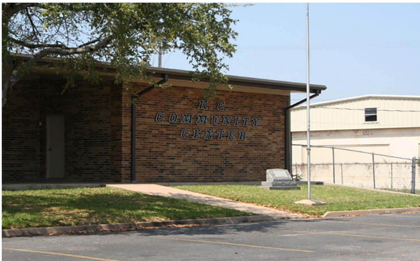
Knights of Columbus, La Grange

Annual Convention March 18, 2017, La Grange, TX The Knights of Columbus Hall 190 S. Brown Street